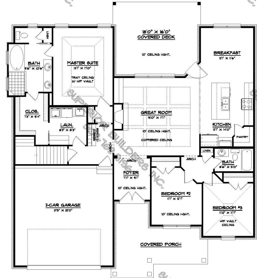
FLOOR PLAN 1,905 SQ. FT.

All drawings and floor plans are artist's concepts and are subject to change without notice. All dimensions are approximates. Pictures may reflect certain options and or changes from plans. This presentation is not part of a legal contract.