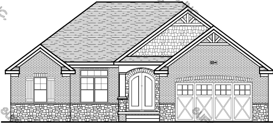
FRONT ELEVATION C