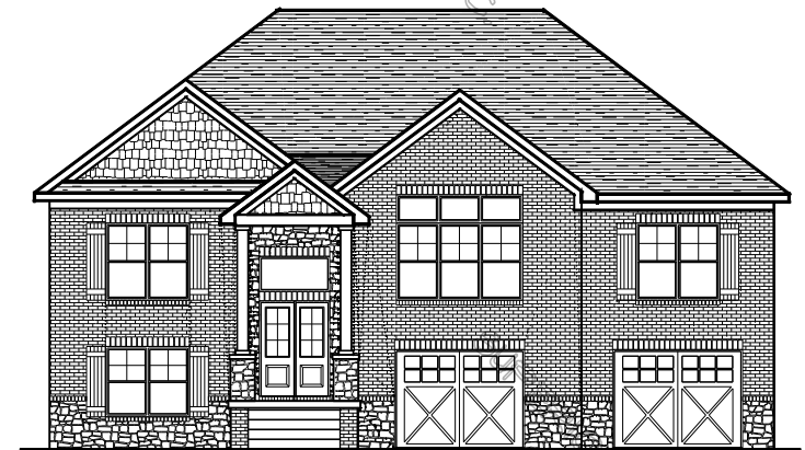
FRONT ELEVATION C