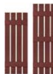
S4 16¼" Four Board