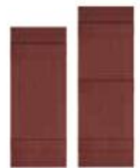
J5 17½" Five Board