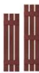
12" Width 3-Board Spaced