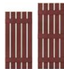
S5 20½" Five Board