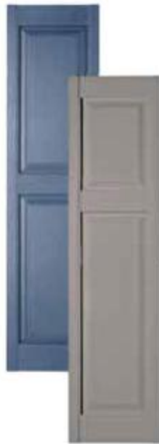
Cottage Style (67" Only)