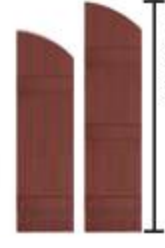
14" Width 4-Board joined w/arch top