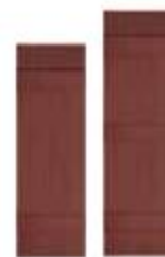
J4 14" Four Board