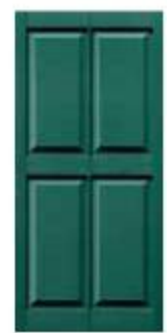
P7 Double Wide