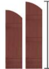
J4-A 14" Archtop Note Length of J4-A includes Arch top maximum height 94"