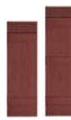
14" Width 4-Board joined